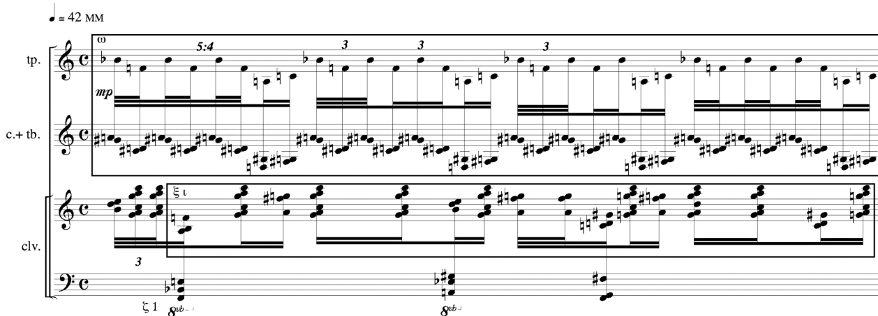
Fig. 13: Excerpts from À l'île de Gorée , bar 127.